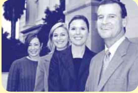
McHugh and Associates

Honorable Mention: Aprea and Micheli, Norwood & Associates